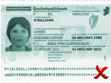
Mono colored Image